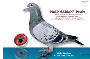
"MAID MARIAN" Petrie Champion Producer, One of Australia's Greatest All-Around Race Birds, One of the Best All-Around Race Birds, The Champion and 10th Best of Grand State Grand State Champion 2012.

aus 40 / 2012 Blue Cheq "Maid Marian" - Foundation hen Direct Daughter of champion Robin Inbred to mazaratti and Zitter. Our best sprint producer ever. Dam of over 11 individual fed birds Including champion Ace hen 1816