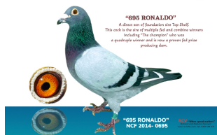
"695 RONALDO" A direct son of Bucklebird the Top Start This cock is the sire of multiple fed and combine winners including "The Champion" who was a quadruple winner and a race proven fed pair producing dam.

ncf 695 / 2014- Ronaldo 695 Blue Bar cock eq 3rd federation first start eq combine winner 200klms Flew Welshpool 800klms Sire of Champion race hens 1816 and 1826